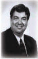
Terry McDonald, Mayor